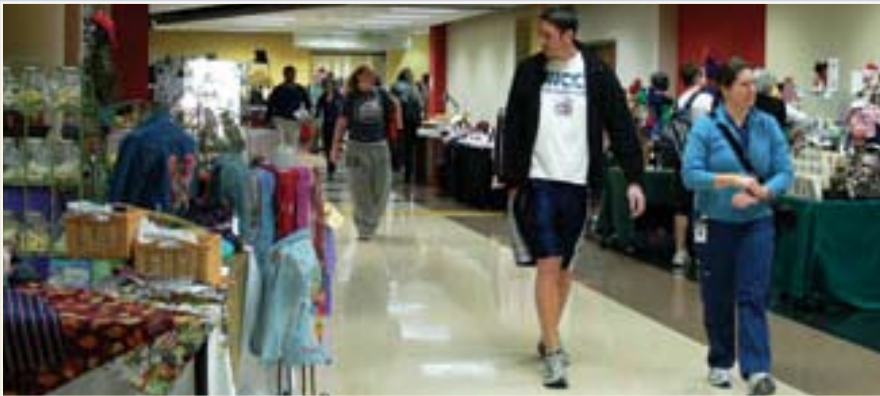
The first Annual RVU Arts and Crafts Show/Fundraiser included local artisans. A percentage of proceeds benefitted RVUCOM's chapter of Student Advocates Association (SAA)—organized for the significant others and families of the students and chartered by the Advocates to the American Osteopathic Association (AAOA). SAA's primary objective is to further the goals of the College and the osteopathic profession and to promote fellowship, goodwill, and unity within the school.