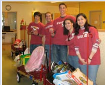
Members of the American College of Osteopathic Pediatricians (ACOP) organized a holiday toy drive and delivered gifts to children at The Children's Hospital in Denver.