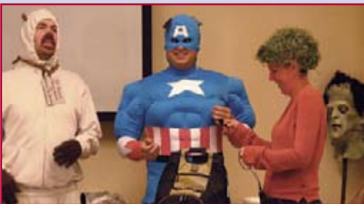
Students, faculty and staff celebrate Halloween with a costume contest and bountiful potluck.