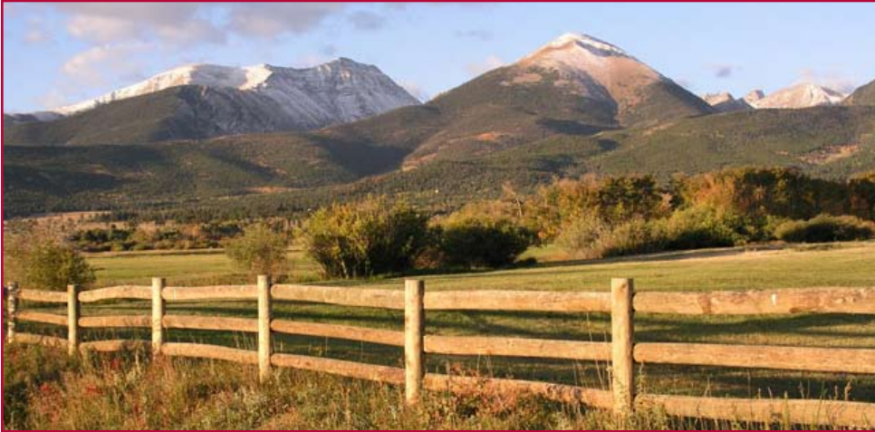
From July 1, 2007 through end of May, 2008, Western Colorado AHEC placed 192 students in housing across the Western Slope.

The national Area Health Education Centers (AHEC) program is part of the U.S. Department of Health and Human Services, Health Resources and Services Administration (HRSA). The AHECs were created to link the resources of universities and health science centers with local agencies planning for the educational and clinical resources required to meet the health care needs of their communities.