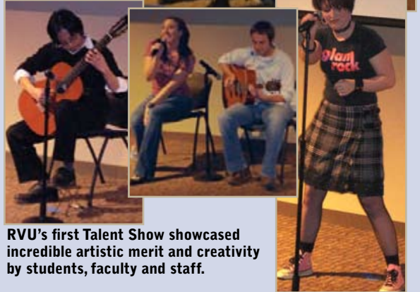
RVU's first Talent Show showcased incredible artistic merit and creativity by students, faculty and staff.